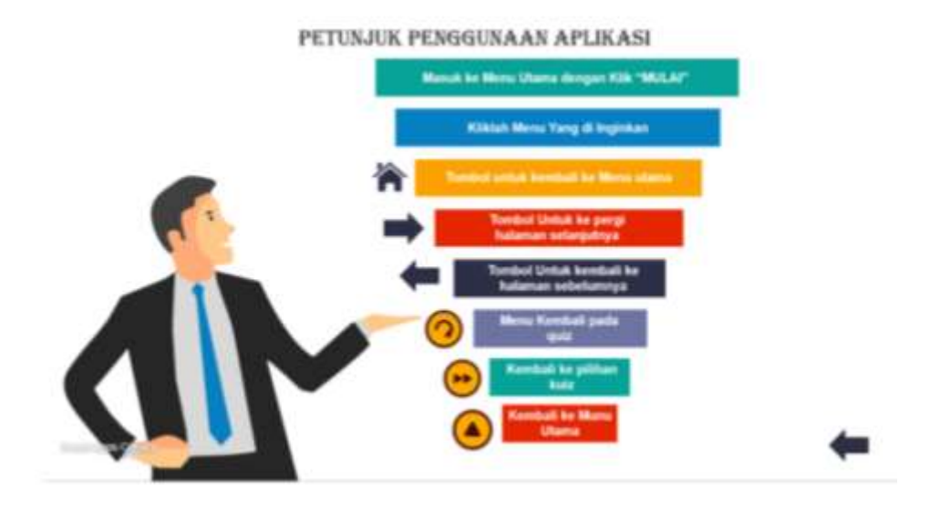
Figure 3. Instructions Menu Page

e-module. There are home, back, and next buttons on the instructions page. Figure 3 illustrates the layout of the instruction menu page.