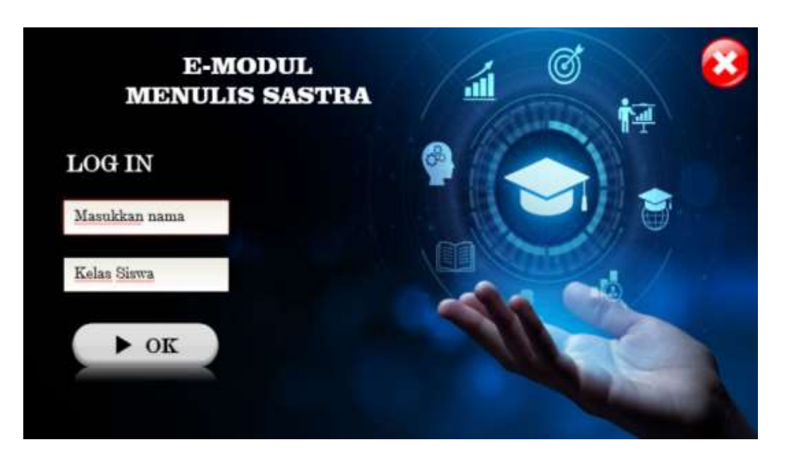
Figure 1. Cover

1. The subject title of the e-module, "Application of Electronic Circuits," is printed on the cover page. The title of the e-module serves to provide users with information about the topics discussed. Figure 1 depicts the cover page's shape.