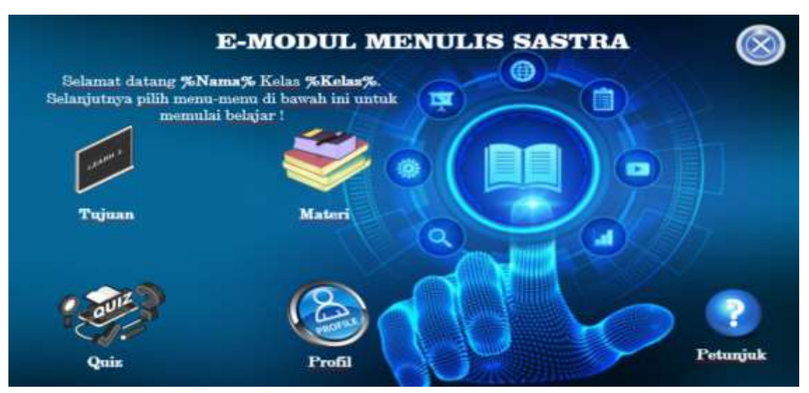
Figure 2. Main Menu Page

4. On the display of the instructions menu page, the Instructions page contains information about general instructions for using the interactive