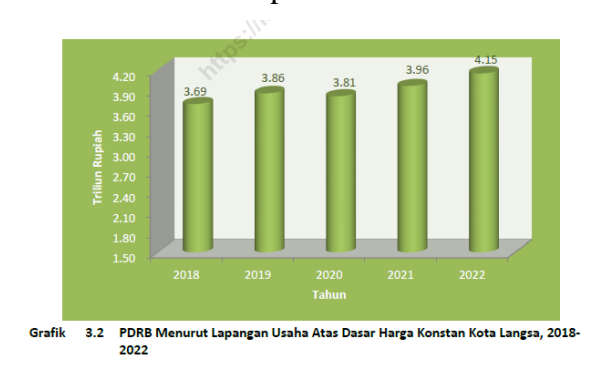
Figure 2. GRDP According to Langsa City Business Field in 2022

the Central Statistical Agency of Langsa City (2022) for the last 5 years, the overall value of PDRB Langsa city on the basis of constant prices has increased every year, since 2018 with a value of Rp 3.69 trillion then increased to Rp 4.15 trillions in 2022.