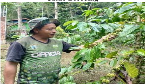
Figure 4. Observations of the Coffee Farmer Group, namely Salatiga Specialty Coffee