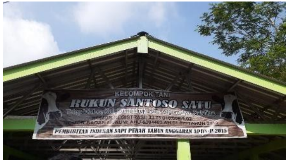
Figure 3.Observations of the RukunSantoso One Farmer Group: Dairy Cattle Breeding

JURNAL IPTEKS TERAPAN Research of Applied Science and Education V16. I1 (14 -19)