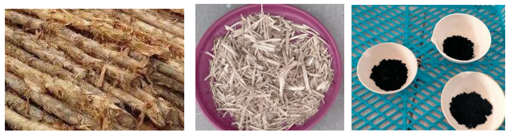
Figure 1. Activated Carbon Gelam bark

The results of previous studies stated that the lead heavy metal content in papuyu fish amounted to (Alawiyah & Rahmadani, 2021), So it is necessary to reduce the metal by exposure to Akif carbon absorent. This research began with the manufacture of activated carbon gelam wood. The process of making activated carbon of gelam wood is divided into three, namely dehydration, carbonization, and activation stages. The initial process is dehydration which aims to eliminate water content (Dewi et al., 2021) in the raw material by cutting small logs and drying in direct sunlight for seven days, then continued with the carbonization process to remove impurities and open the pores of activated carbon of gelam wood and the last process is activated by dehydration using akivators such as NaCl, Ca (OH), MgCl<sub>2</sub>, HNO<sub>3</sub>, HCl, KOH, ZnCl<sub>2</sub>, H3PO4 (Fanani, N dan Ulfindrayani, 2019).